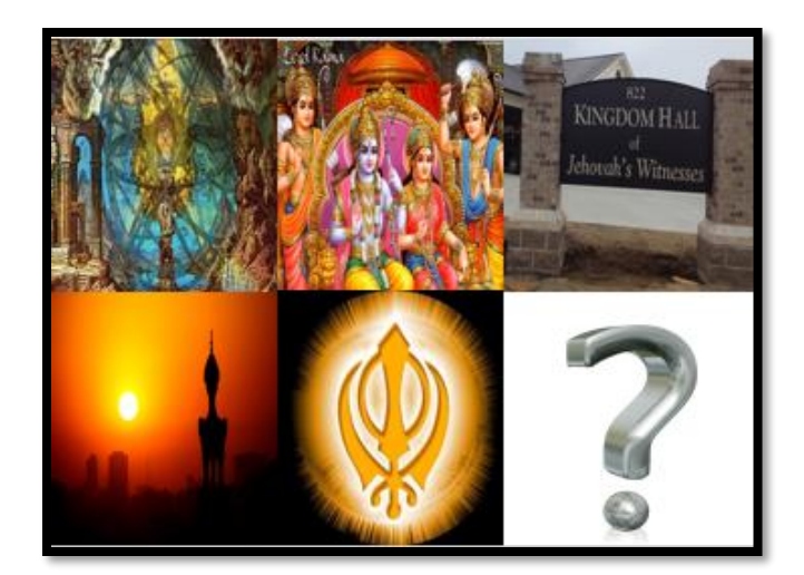
any and all paths will lead to His presence.<sup>7</sup>

For Jehovah Witnesses while salvation was made possible through the death of Jesus, only those who learn and obey Jehovah's requirements, a mere 144,000, will participate in His kingdom while the rest will be annihilated. For the Sikhs they believe that a person will be reincarnated until they overcome self by realigning to the will of God and once this is accomplished will merge with Him.<sup>6</sup> Being in contact with so many divergent beliefs has left postmoderns to come to the belief that either God does not exist, a singular path to Him cannot be known or