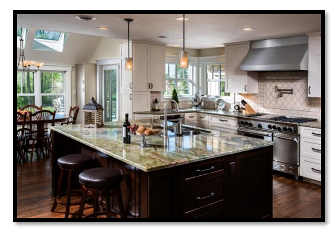
its features fit both our needs and wants.

home that was more practical we weighed each item that we "wanted" against its associated costs. For example, if a paved driveway added 10k cost to the home we asked the question: was a smoother driveway without loose rocks worth spending the extra money? If two extra bathrooms added 15k cost to the home was the convenience of never having to "hold" it or wait one's turn for a bath worth the extra costs? When looking at a prospective home we first looked to see if the price fit our financial budget and then explored how well